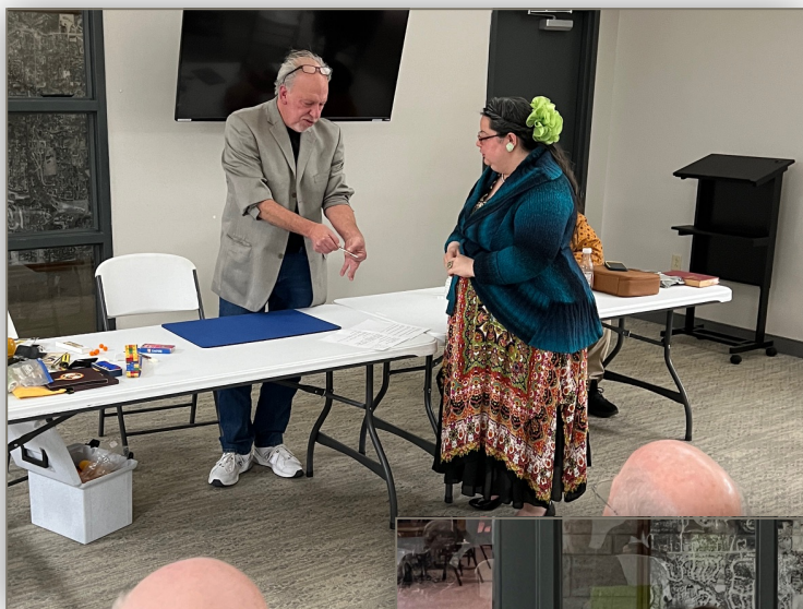
Photos of the January Ring 1 meeting